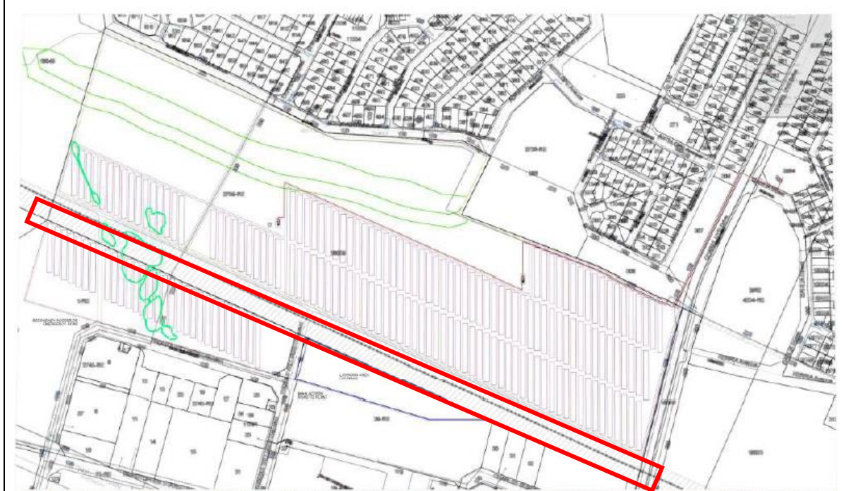
Figure 3: Layout of the tracker panels alternative superimposed on the dune slack wetlands on site. Red polygon shows the Eskom servitude.