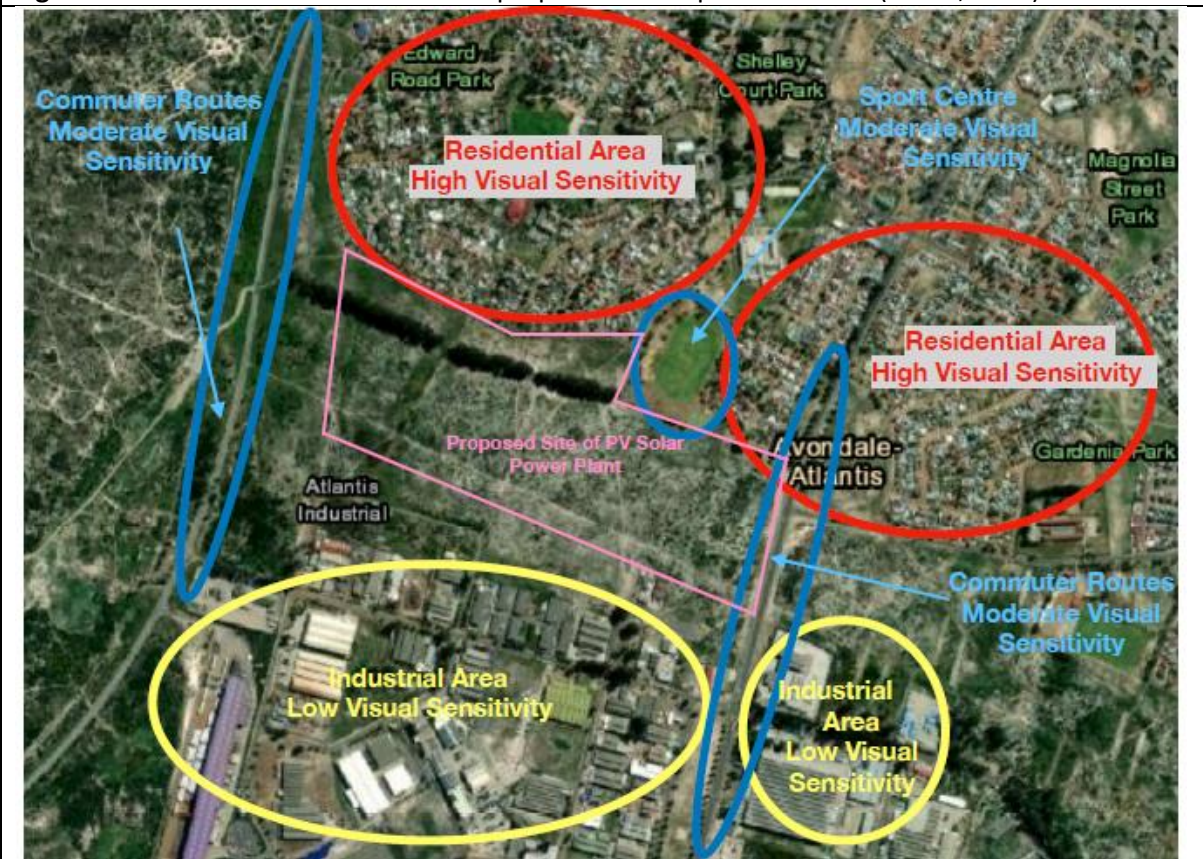
Figure 5: Visual receptors of the proposed development.