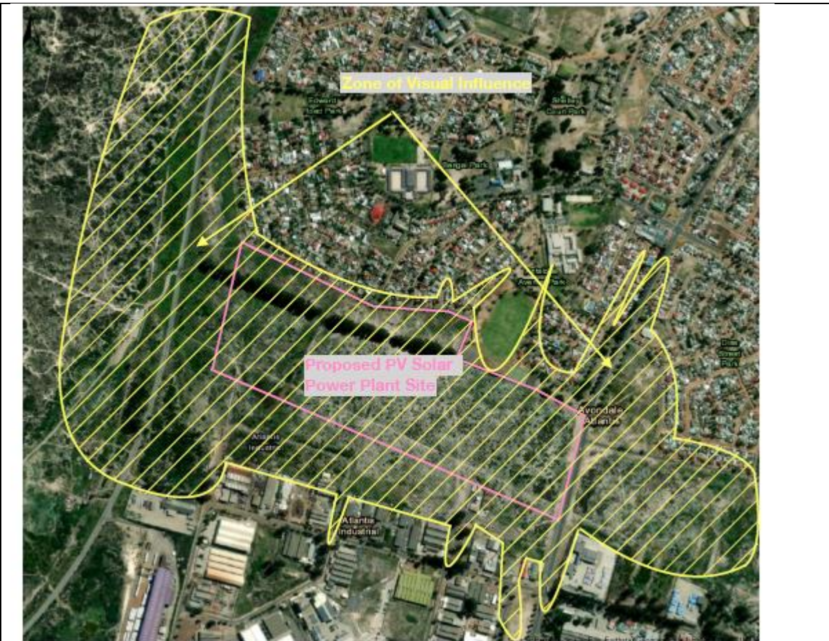
Figure 4: Zone of Visual Influence of the proposed development.