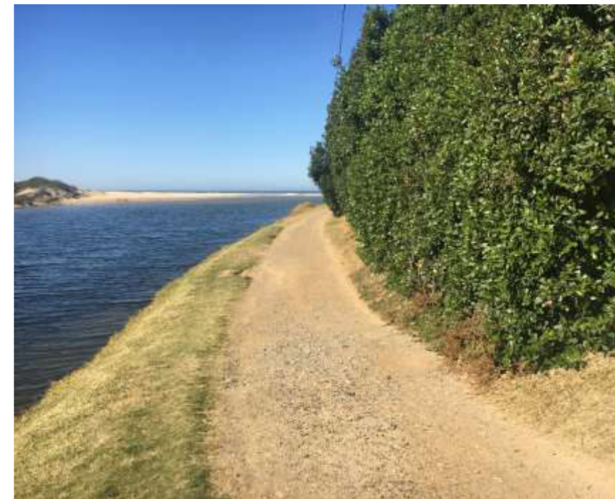
Photo 2: Southerly view of the road to be upgraded at 33° 33' 37.40\"/>