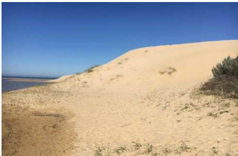
Photo 5: Southerly view of road to be upgraded at 33° 33' 39.05\"/>