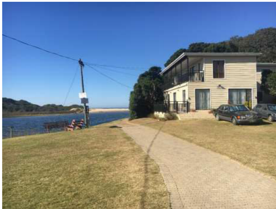
Photo 1: South-easterly view of the section of road to be upgraded at 33° 33' 37.14\"/>